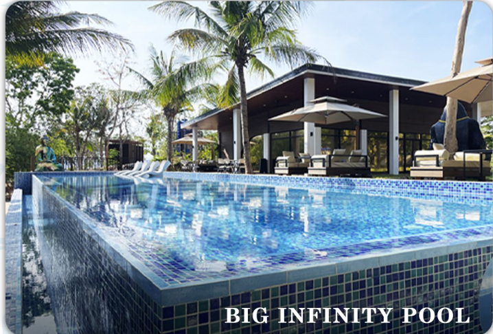
BIG INFINITY POOL