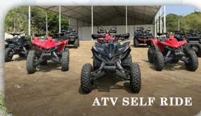
ATV SELF RIDE